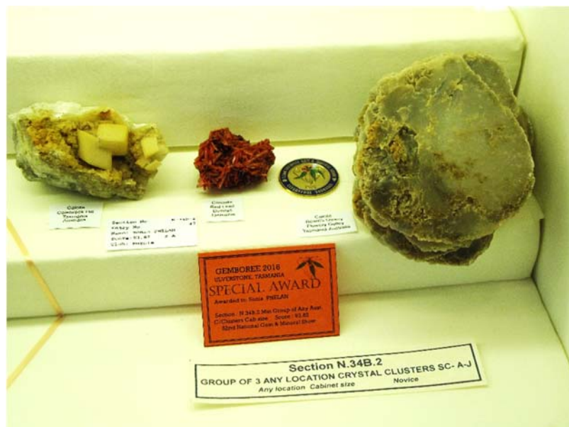
There were over 700 entries in total for the Competition Section and all of a high standard. Local entrant S. Phelan won 4 special award medallions and two Launceston entrants received placings for their entries.