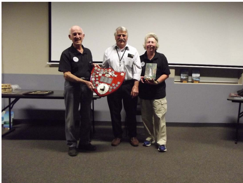
Visitors from NSW receiving the Club Champion Trophy for most entries from one club.