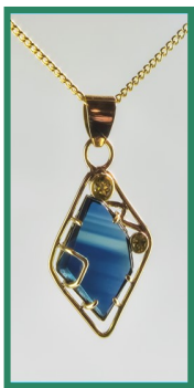
1st Prize $5,934

As well as online tickets, 2000 paper tickets (1-2000) have been printed. Any club wanting paper tickets to sell should contact GEMBOREE2019@outlook.com.au. They come in booklets of 10 with each ticket costing $5. On their return the information from the sold paper tickets will be entered into the Raffletix database. Raffletix tickets start at 2001. This will be our major fundraiser to help cover the costs of running the GEMBOREE. GEMBOREE 2019 is most appreciative of the generosity of the donors of the prizes who all recognize the significant costs associated with running a GEMBOREE. (See GEMBOREE booklet for details)