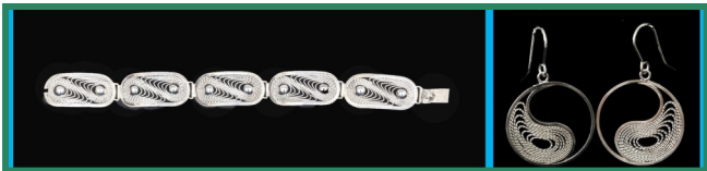
4th Prize $1,185