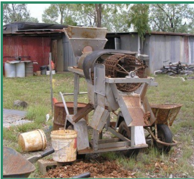
Rob and Kathy's trommel, used to sieve wash. The buildings behind are typical of the infrastructure found on mining claims