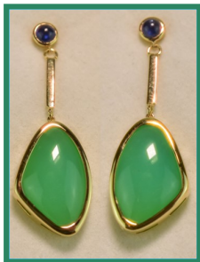
2nd Prize $4,168