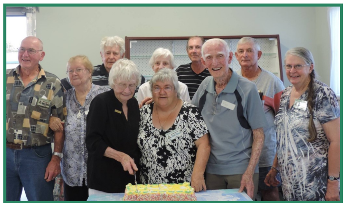
Bundaberg Club celebrating 50 years

For session times and more information on the club see http://bundaberg.lapidaryclub.com.au/