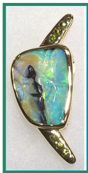
3rd Prize $3,905