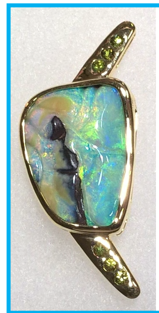
Boulder Opal and Sapphire Brooch/ Pendant set in Gold