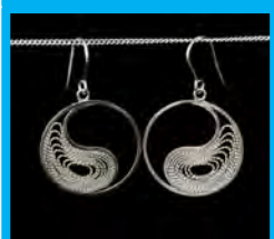
Silver Filigree Bracelet with matching Earrings