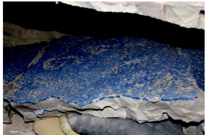
Numerous coalesced azurite suns found in the Adit Face - potential exotic coffee table displays

dehne.mclaughlin@bigpond.com if you want to be a part of that adventure in 2019.