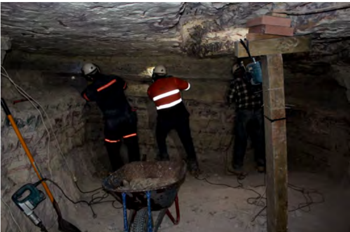
The USA team preparing a half metre deep undercut