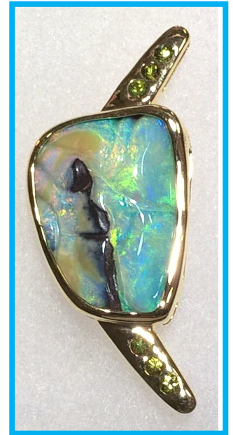
Boulder Opal and Sapphire Brooch/ Pendant set in Gold