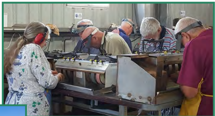
Members busy in our well-equipped workshop