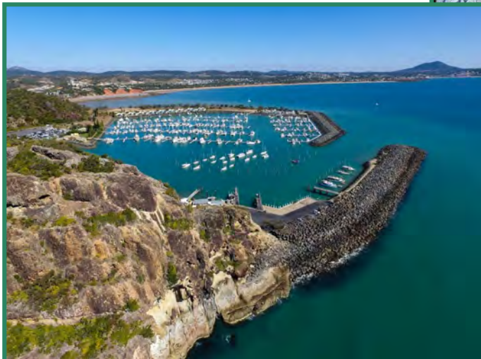
The beautiful Capricorn Coast, looking from Double Heads, across the Marina, towards Yeppoon.