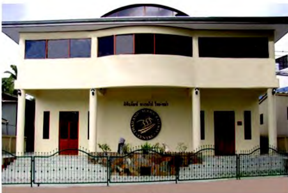
The Thai-Burma Railway Centre Kanchanaburi