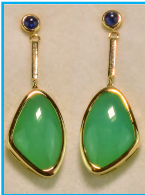
Chrysoprase and Sapphire Earrings set in Gold