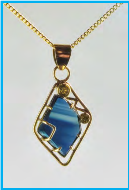
8.5ct Sapphire Pendant