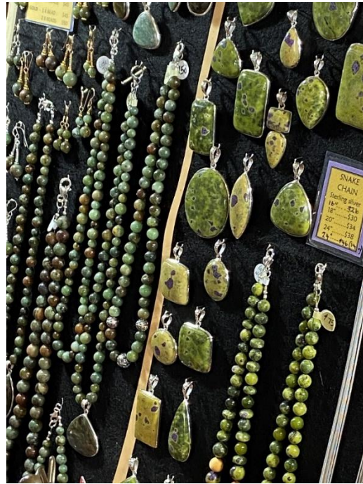
Hall Trader – Lunaris Gemstones