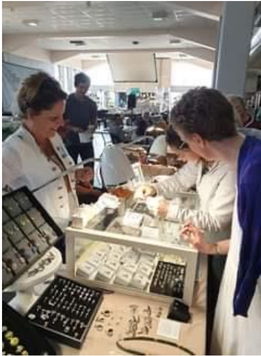
Hall Trader – Rare and Beautiful