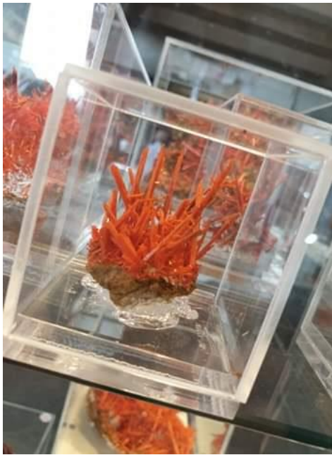
Hall Trader – The Adelaide Mining Company Pty Ltd – Crocoite specimen